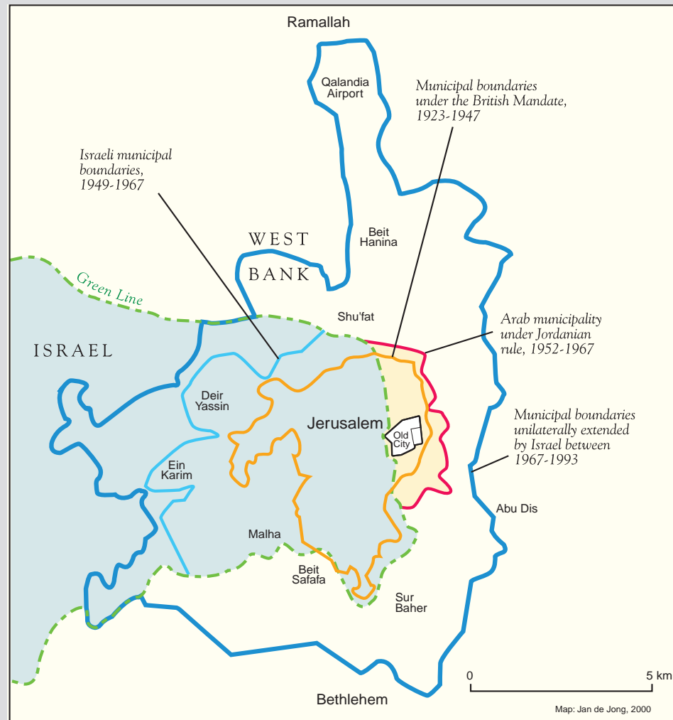
Municipal Boundaries of Jerusalem, 1947-2000